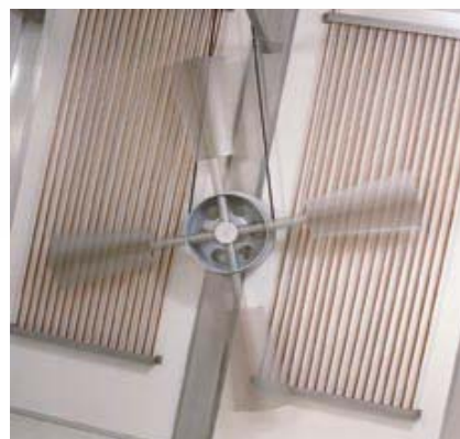
Integrated heating & cooling system