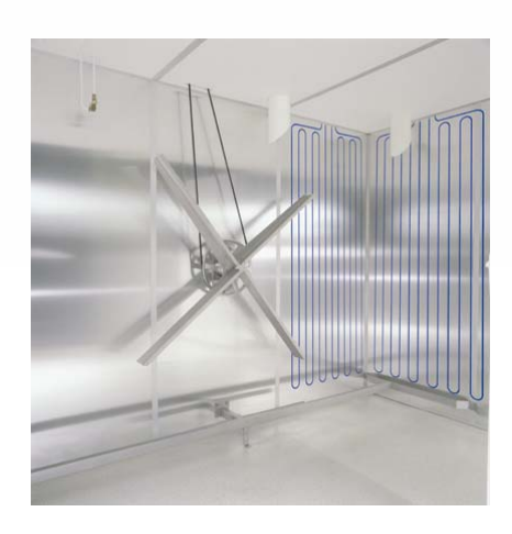
Surround Cooling^{\text{\scriptsize TM}}