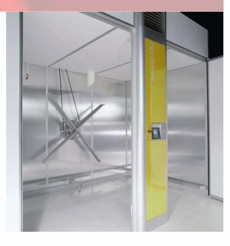
Robust, easy-to-clean construction