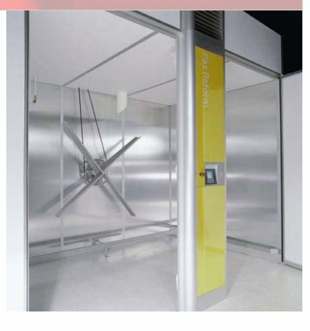
Robust, easy-to-clean construction